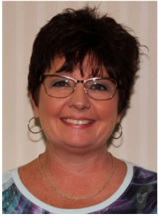
Assistant District Representative