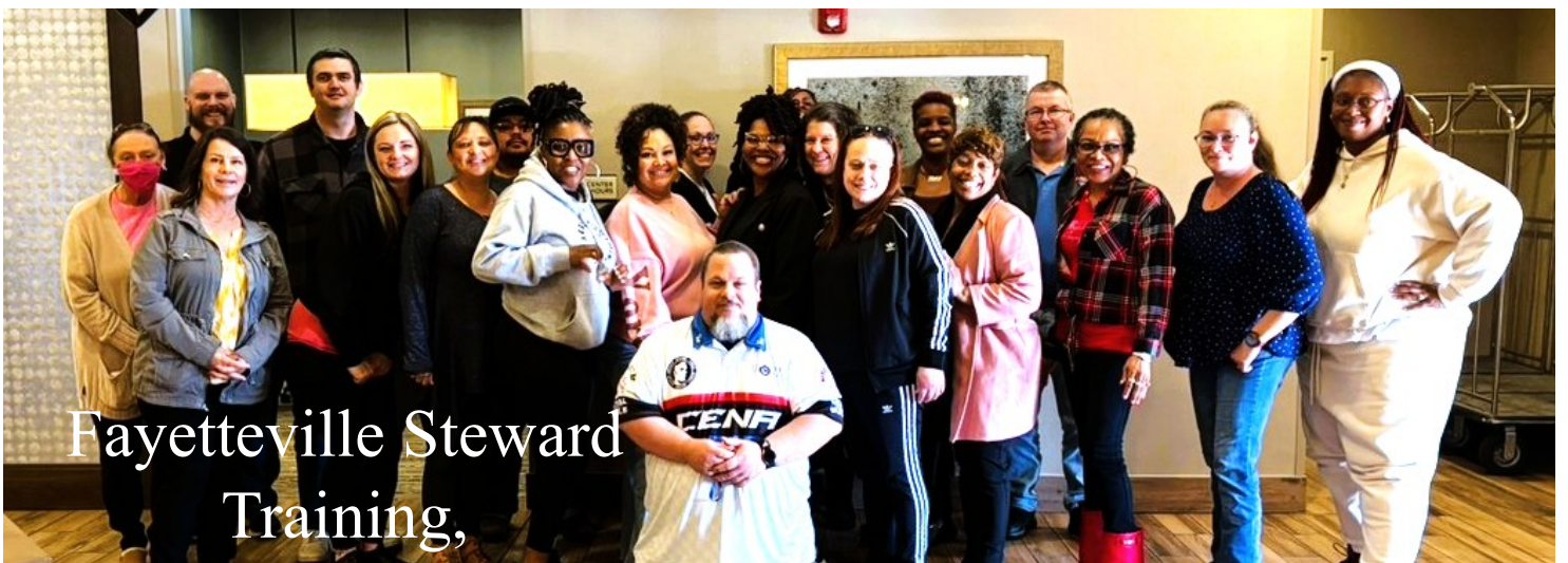
Fayetteville Steward Training,