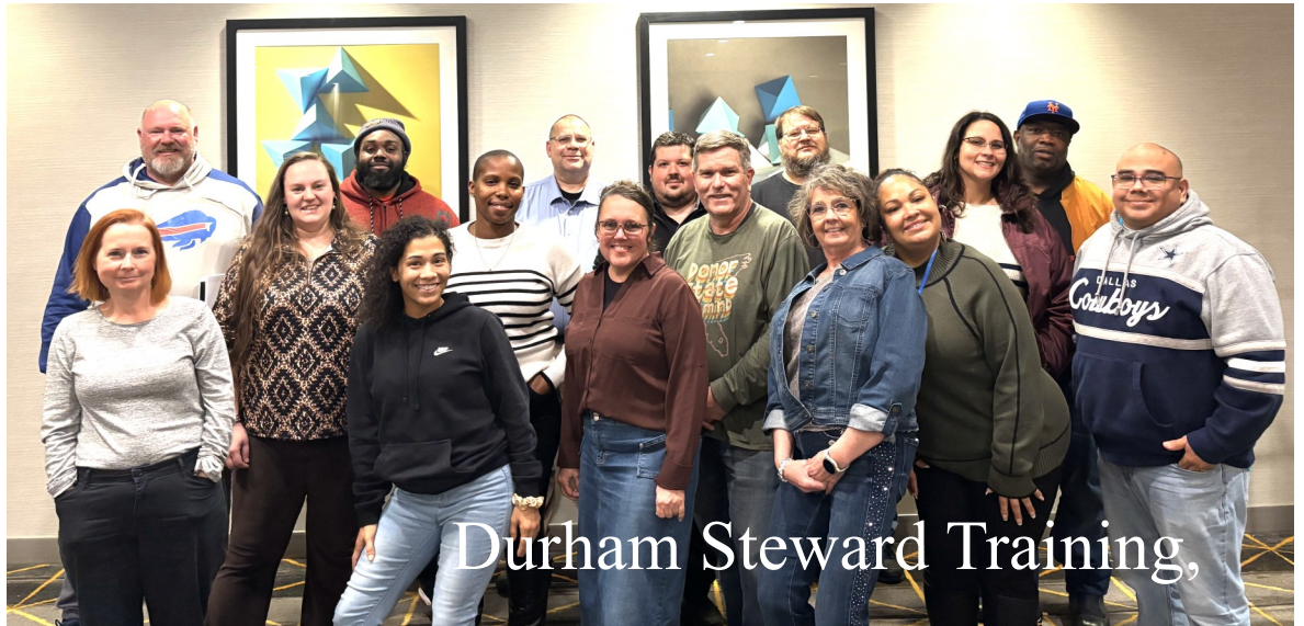
Durham Steward Training,